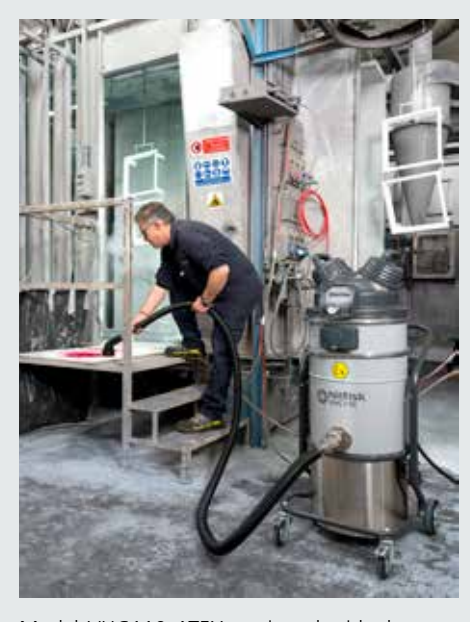
Model VHC110 ATEX equipped with the new ATEX accessories