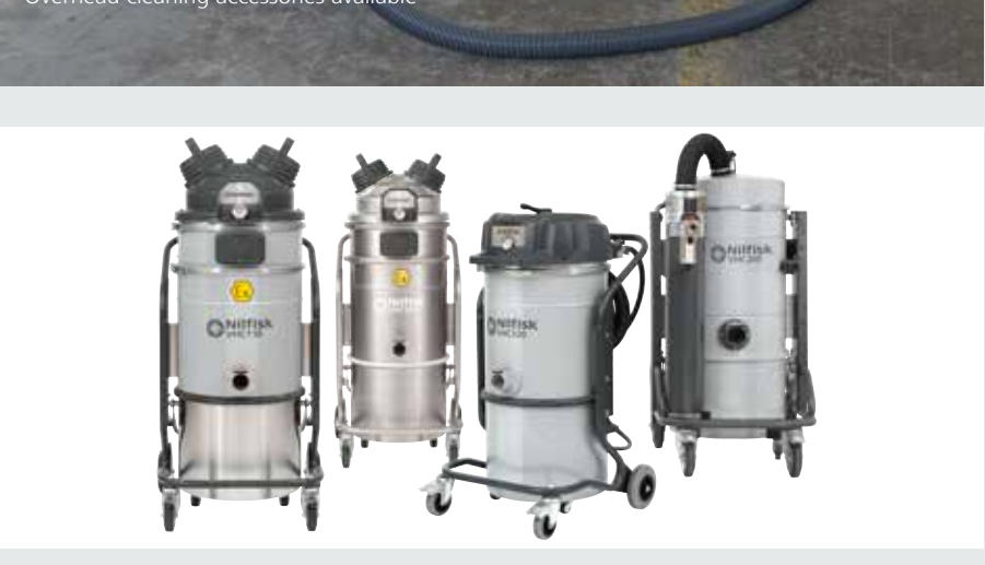
Nilfisk's complete range of compressed air industrial vacuums