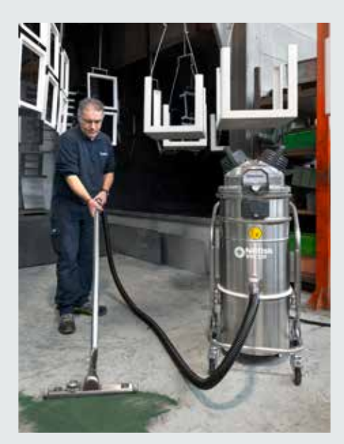
Ensure total safety while cleaning the working environment