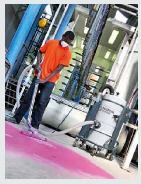
Recovery of epoxy powder from all surfaces